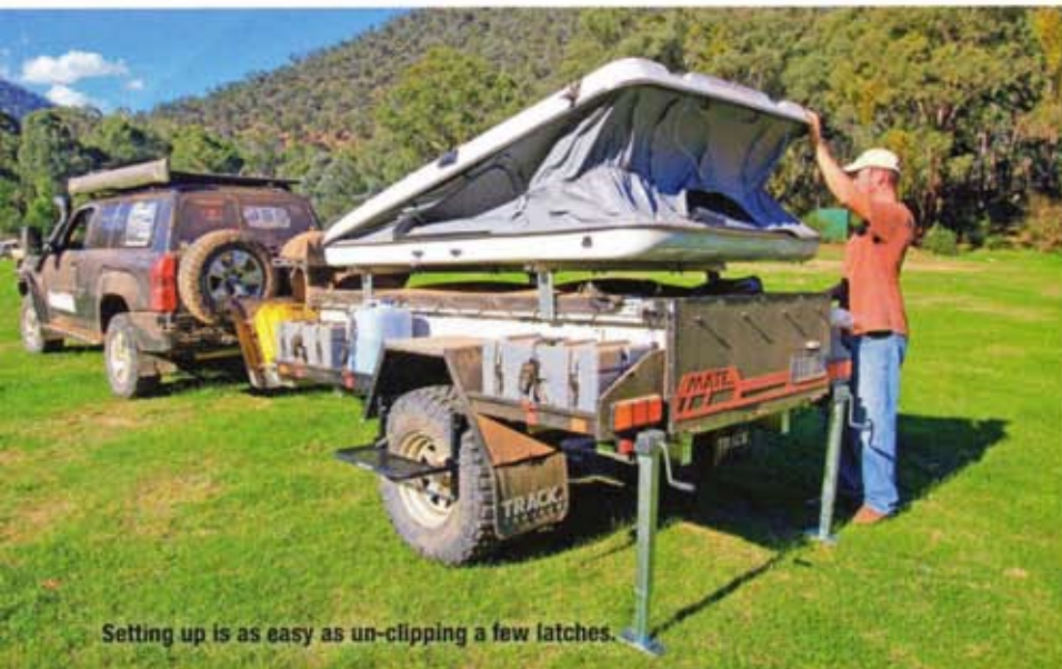
Setting up is as easy as un-clipping a few latches.

Head room could be improved for tall folk, particularly with the integrated luggage rack intruding down one end of the canopy. In comparison, the canvas roof option by way of an ARB rooftop tent provides 1300mm of headroom.