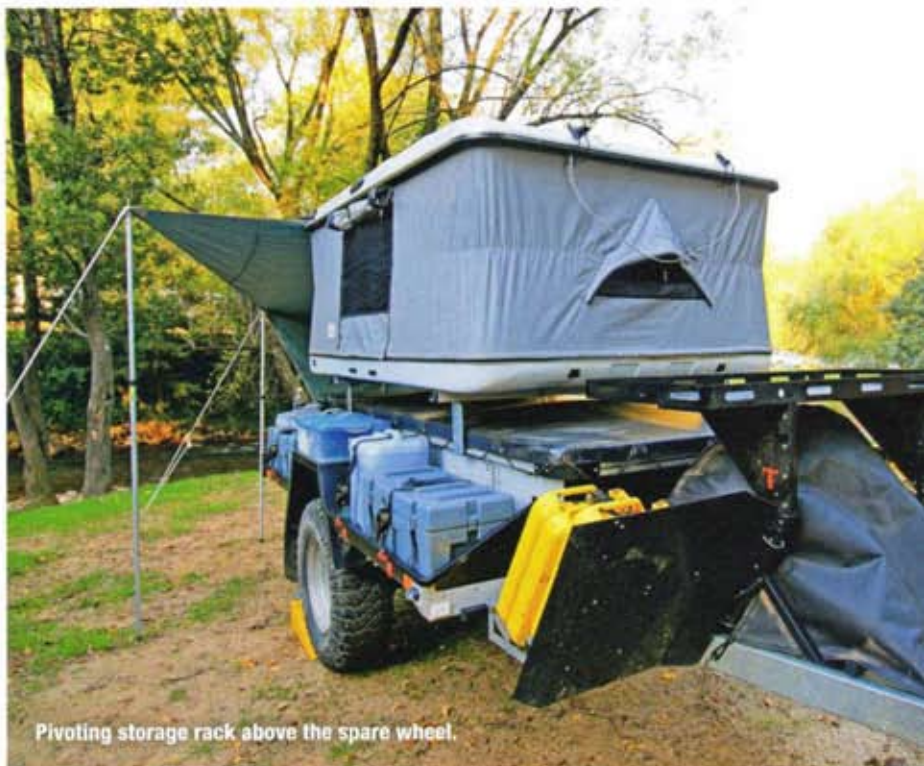
Pivoting storage rack above the spare wheel.